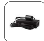
AC adapter kit