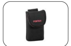
Black neoprene case