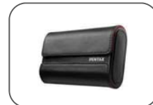
Black leather case