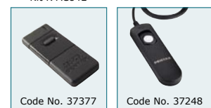
Code No. 37377 Code No. 37248