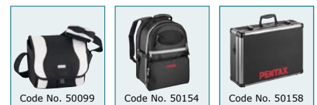
Code No. 50099 Code No. 50154 Code No. 50158