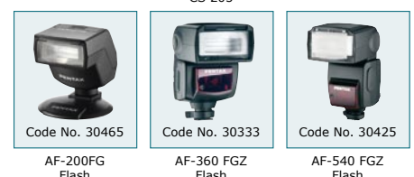
Code No. 30465 Code No. 30333 Code No. 30425