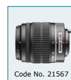
Code No. 21567 smc PENTAX DA L 50 – 200mm f/4.0 – 5.6 ED