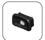
Magnifying Eye cup