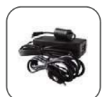
AC adapter kit