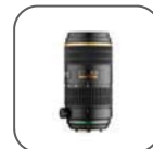
DA* 60-250mm lens