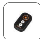
WP remote control