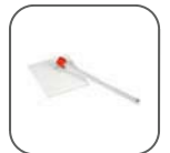
Sensor cleaning kit